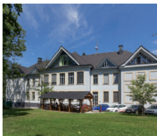
NAM system headquarters

We know what is important in the field of security and related devices and services. We provide 24/7 support and monitoring of provided technologies.