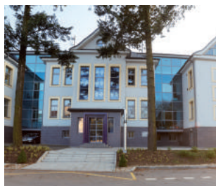
NAM system headquarters